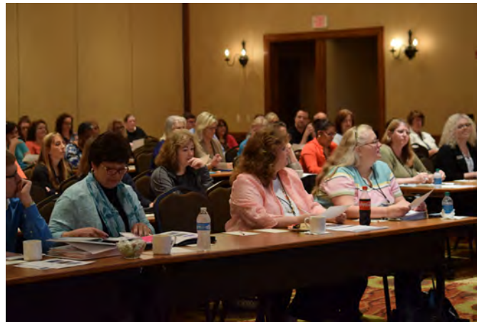
Conference attendees packed Stonewall Resort for an information filled two-day conference.

The West Virginia State Treasurer's Office hosted the 2018 Cash Handling Conference for state financial professionals in April 2018 at Stonewall Resort in Lewis County.