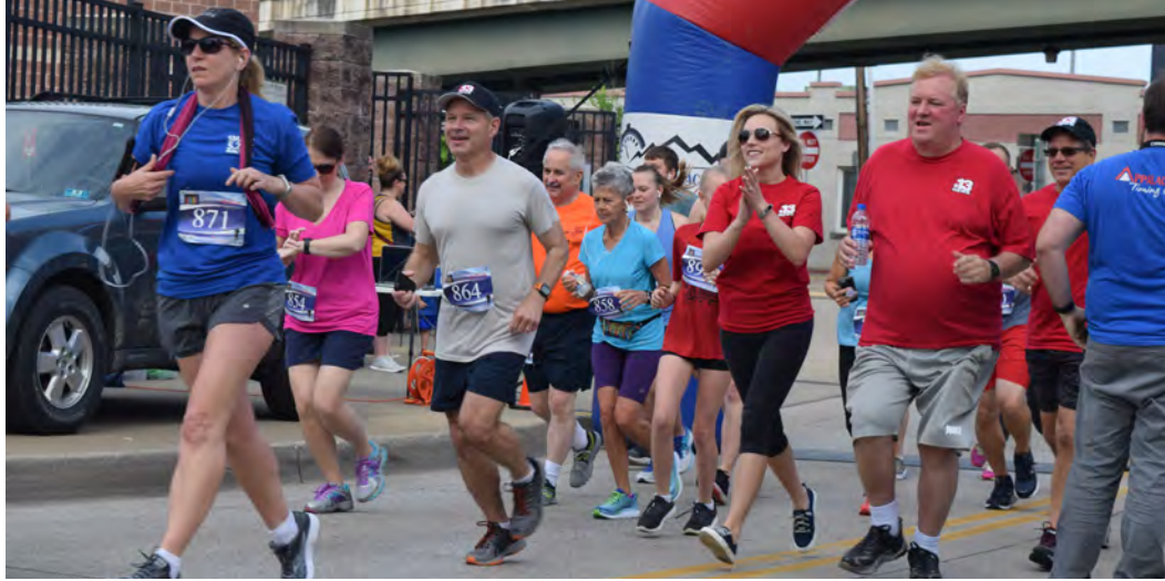
Dozens of runners and walkers kickoff the SMART5.29K event on Charleston's East End.

The Treasurer's Office, in conjunction with Frameworks, Inc. and a host of other partners, presented the fourth annual SMART5.29K run/walk in May 2018.