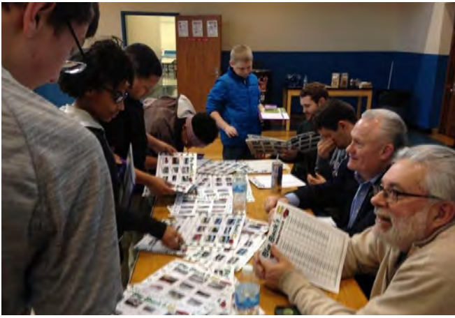
Students at South Charleston Middle School choose which car to buy with help from volunteers during a Treasurer's Office Get a Life event.

The SMART5.29K walk/run, now in its fourth year, is held each May to raise money to provide college savings funds for children adopted out of foster care in West Virginia. In the past three years, 31 families have been awarded $37,000.