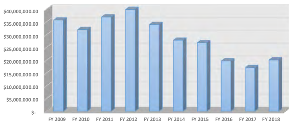
Coal severance distributions past 10 years

While not every county in West Virginia produces coal, all counties receive a severance tax paid by the coal industry. Coal producing counties receive 75 percent of the net proceeds. The remaining 25 percent of the net proceeds are distributed to all counties and municipalities of the state, based on population. *See annual breakdown below.