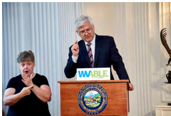
Treasurer Perdue speaks during the launch event of the WVABLE program.

Federal eligibility standards for certain needs-based benefits programs have historically limited personal assets to $2,000 for individuals with disabilities.